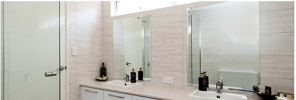
Mirrors perfectly placed with Ritetack... no propping & in no time.